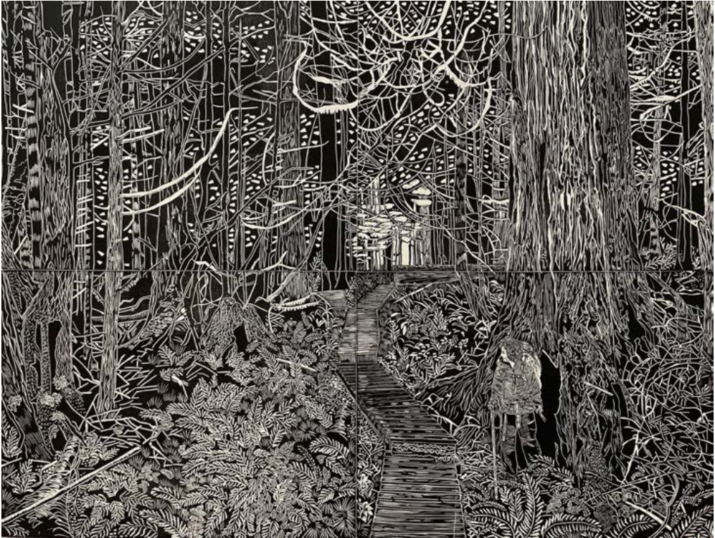
SIOBHAN ARNOTT- 2022