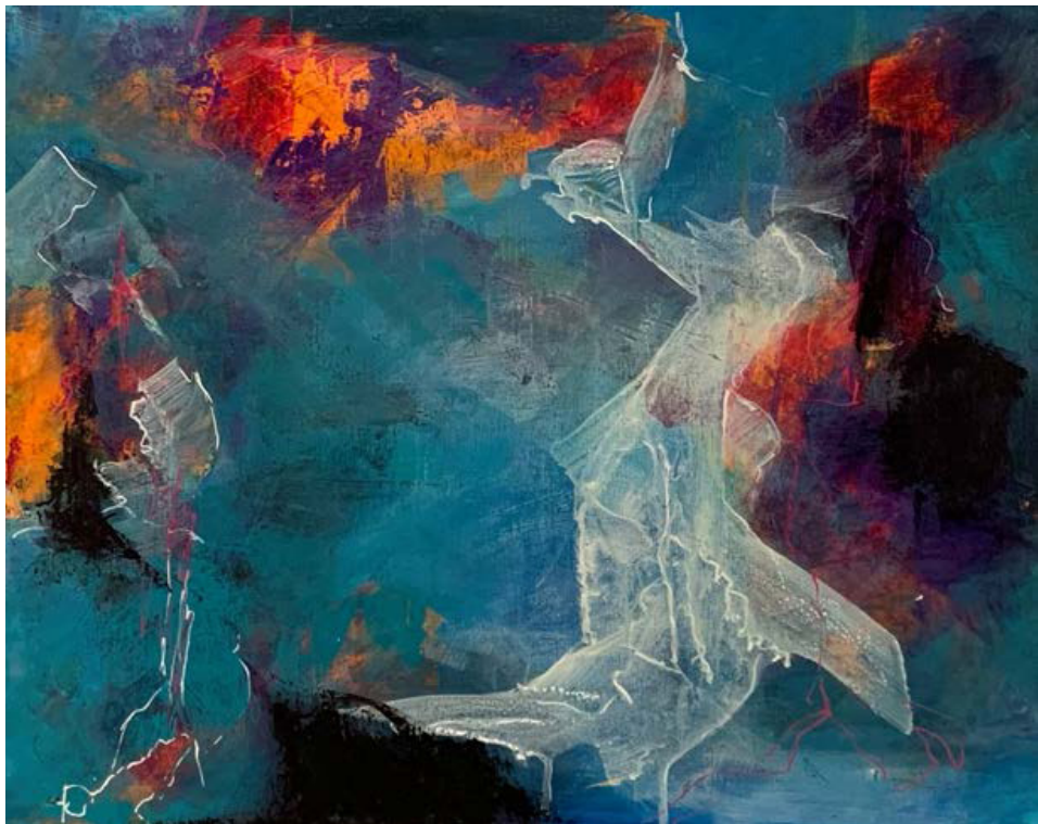
PAM BIXEL - 2022