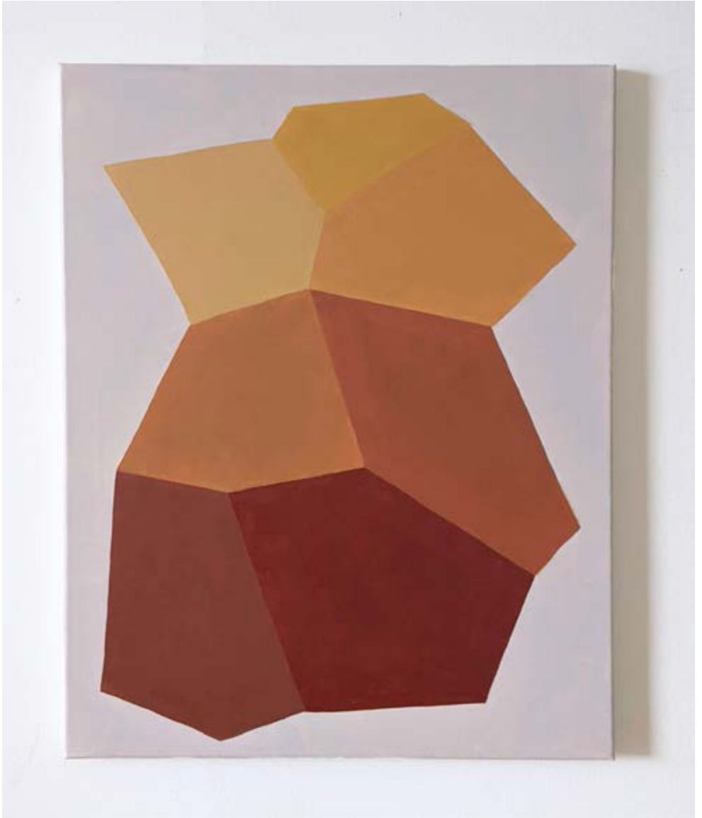
ANNE BELL - 2022