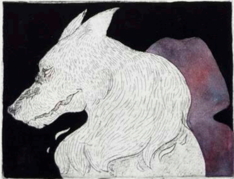
STEPHANY LAY- 2022